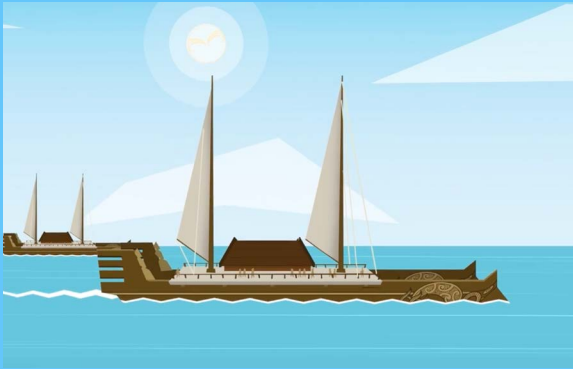
waka hourua/ double-hulled canoe