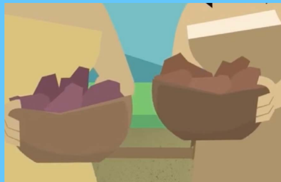
kete kai/ food baskets