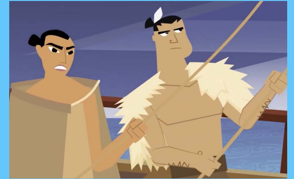
kaumoana/ crew members